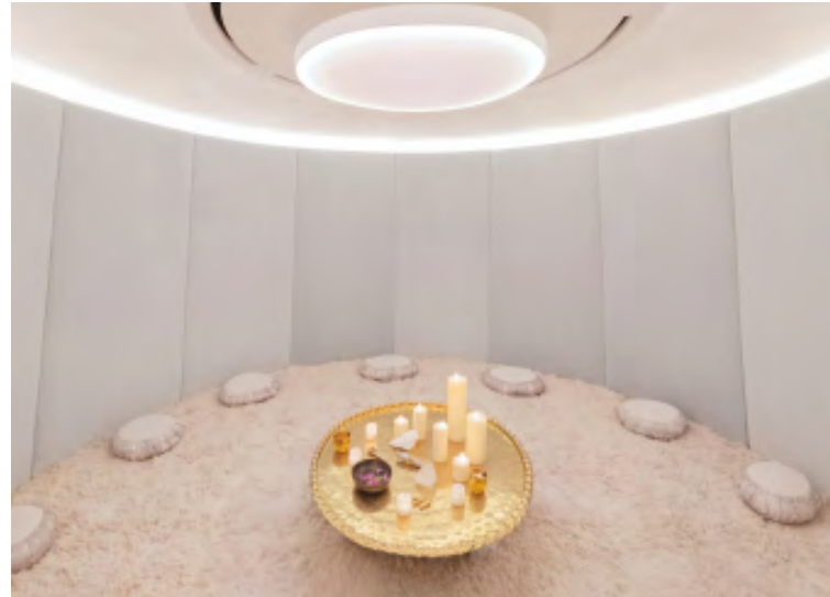
THE WELL New York