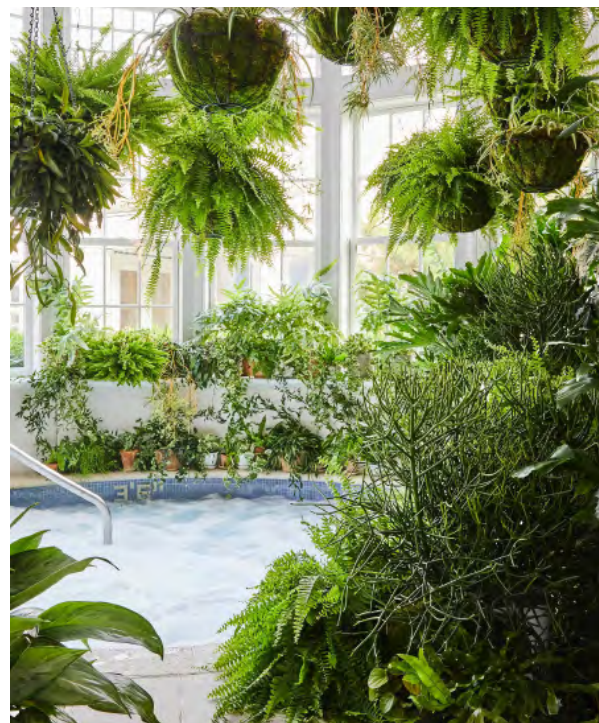
THE WELL at Mayflower Inn