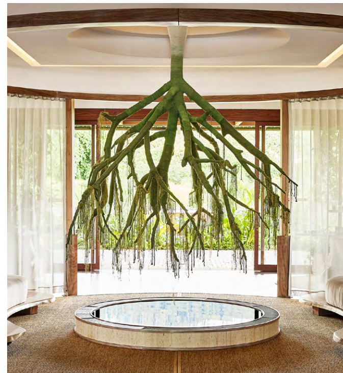
THE WELL at Hacienda AltaGracia