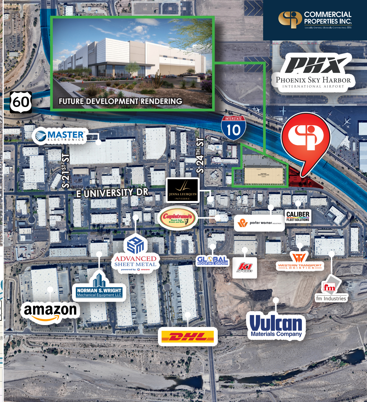
FUTURE DEVELOPMENT RENDERING