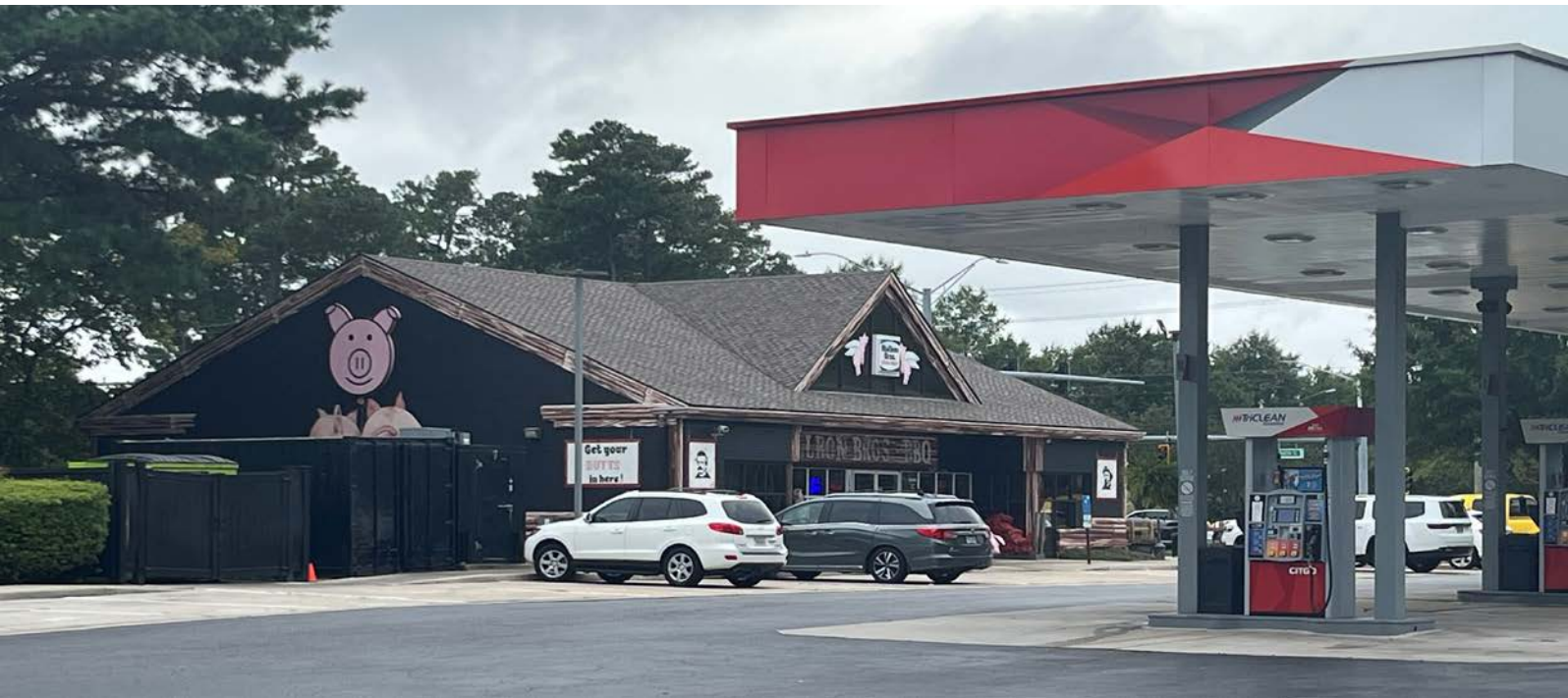
Malbon Bros. Corner Mart BBQ & Gas Station | 1896 General Booth Blvd., Virginia Beach, Virginia