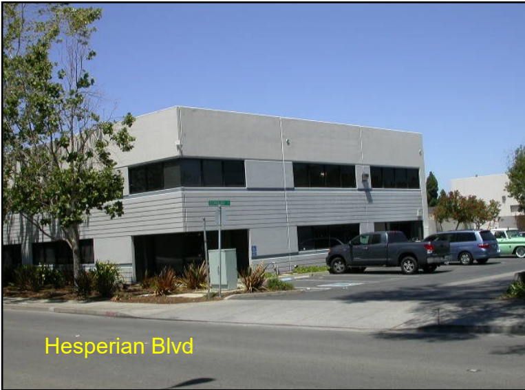
Front of Building from Hesperian Blvd