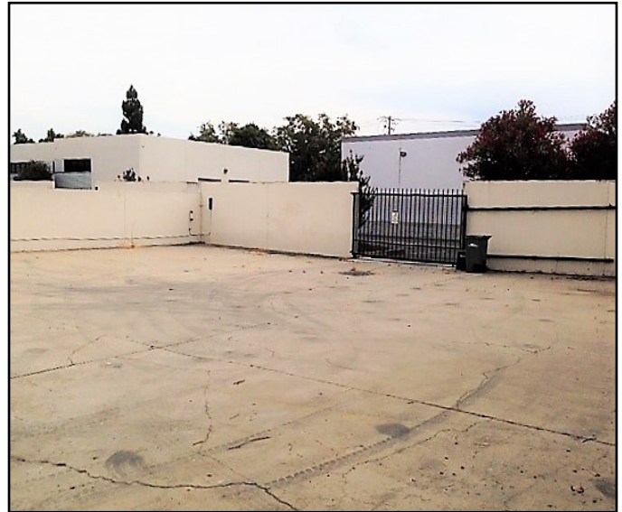
Private Yard Area: 62'± by 62' ±