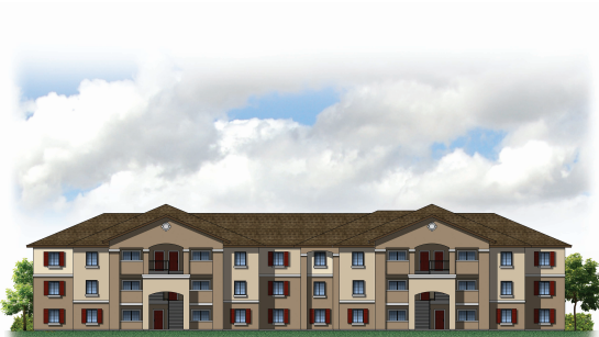
STAFFORD WAY APARTMENTS