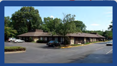
1910 Marlton Pike East, Suite 8