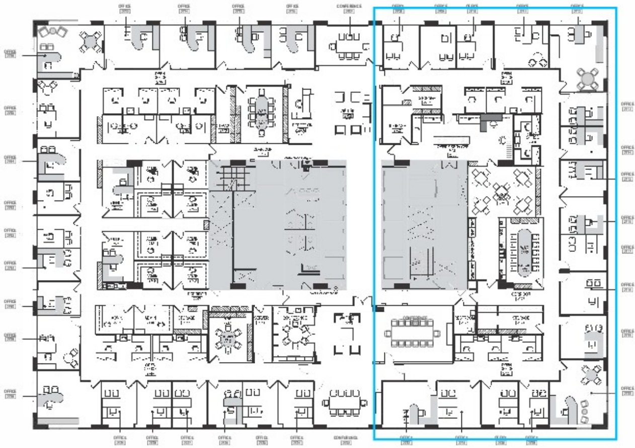
Available offices on south end of the floor