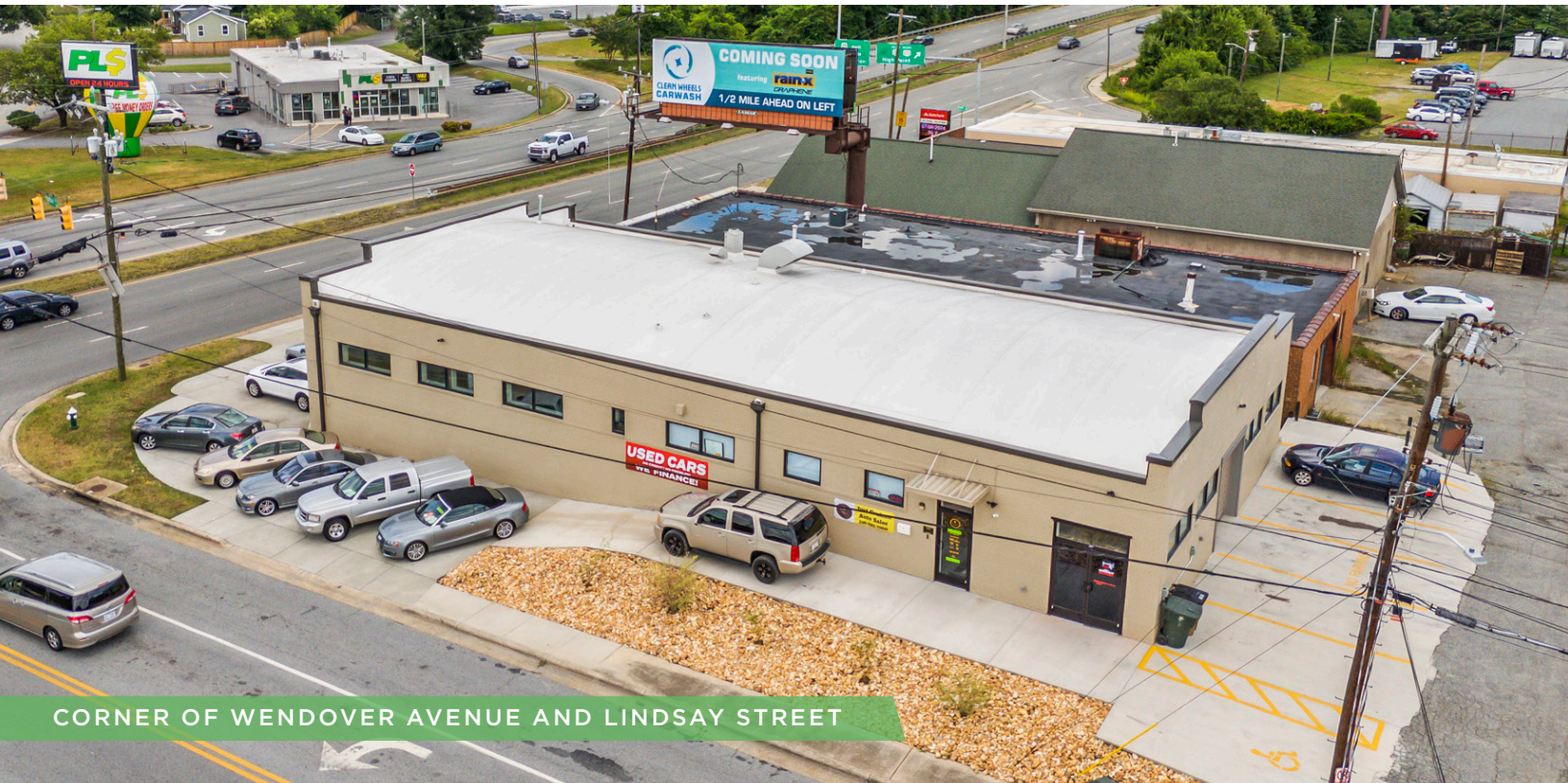
CORNER OF WENDOVER AVENUE AND LINDSAY STREET