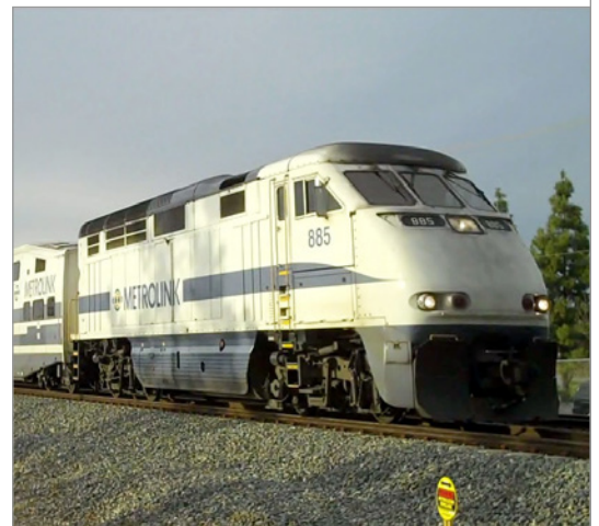
City of Industry Metrolink Station located across the street.

Shea Center Walnut is owned and operated by the 125-year old J.F. Shea Company, with its corporate headquarters right next door. In addition, the leasing office is located on-site for the convenience of our tenants. For more information about Shea Center Walnut and to view a current list of available space, visit SheaProperties.com .