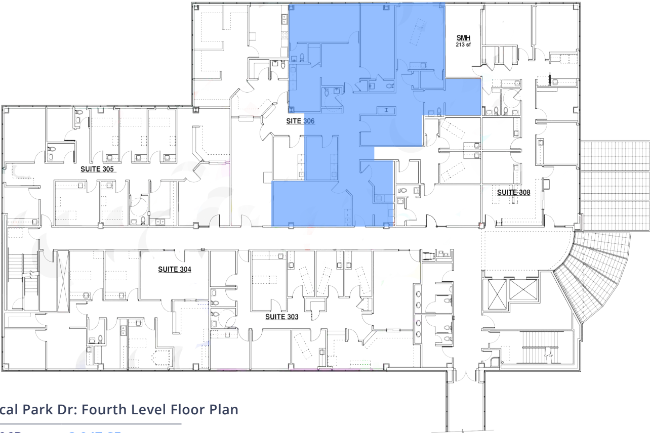
5 Medical Park Dr: Fourth Level Floor Plan