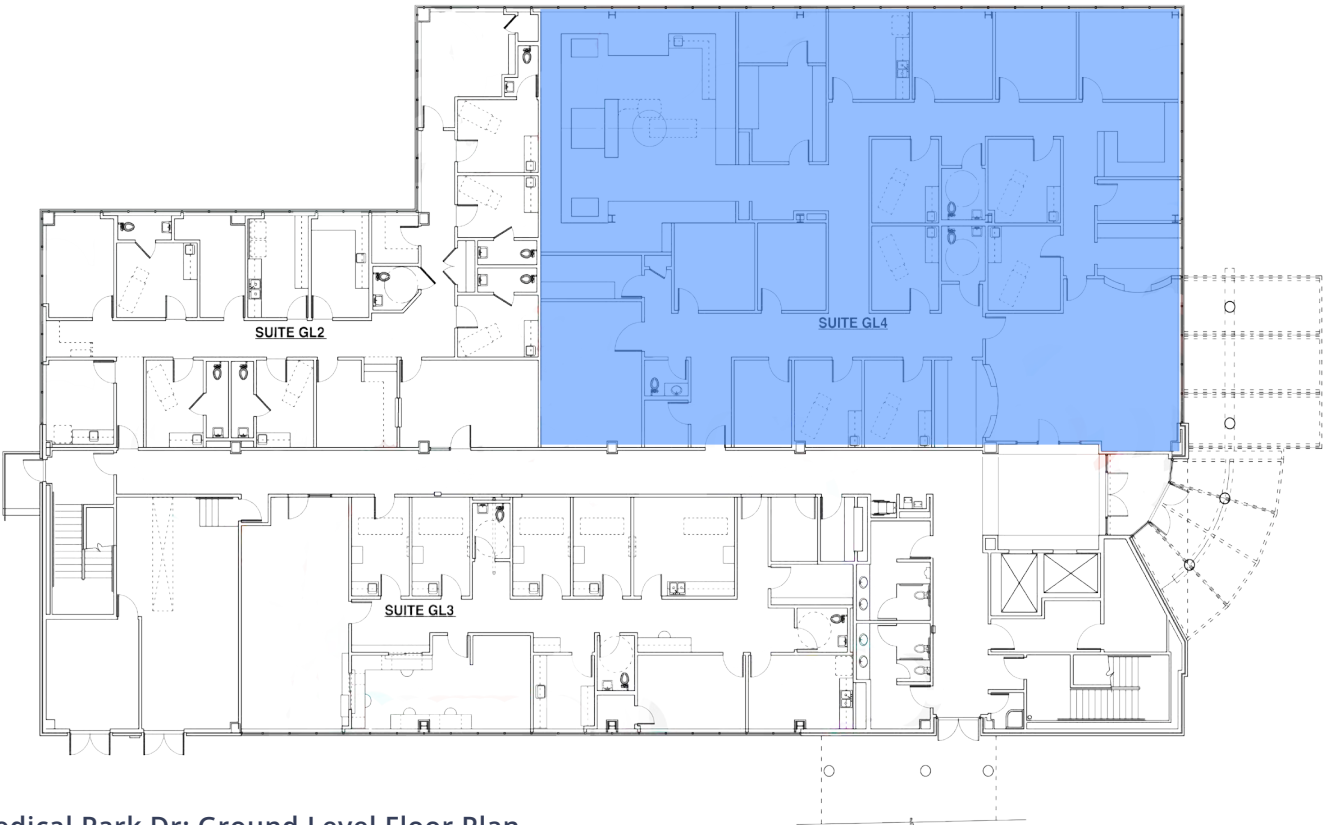
5 Medical Park Dr: Ground Level Floor Plan