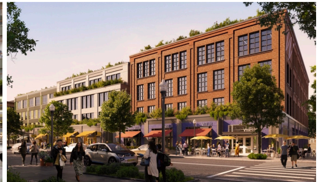
FUTURE DEVELOPMENT OF ONE WESTFIELD PLACE