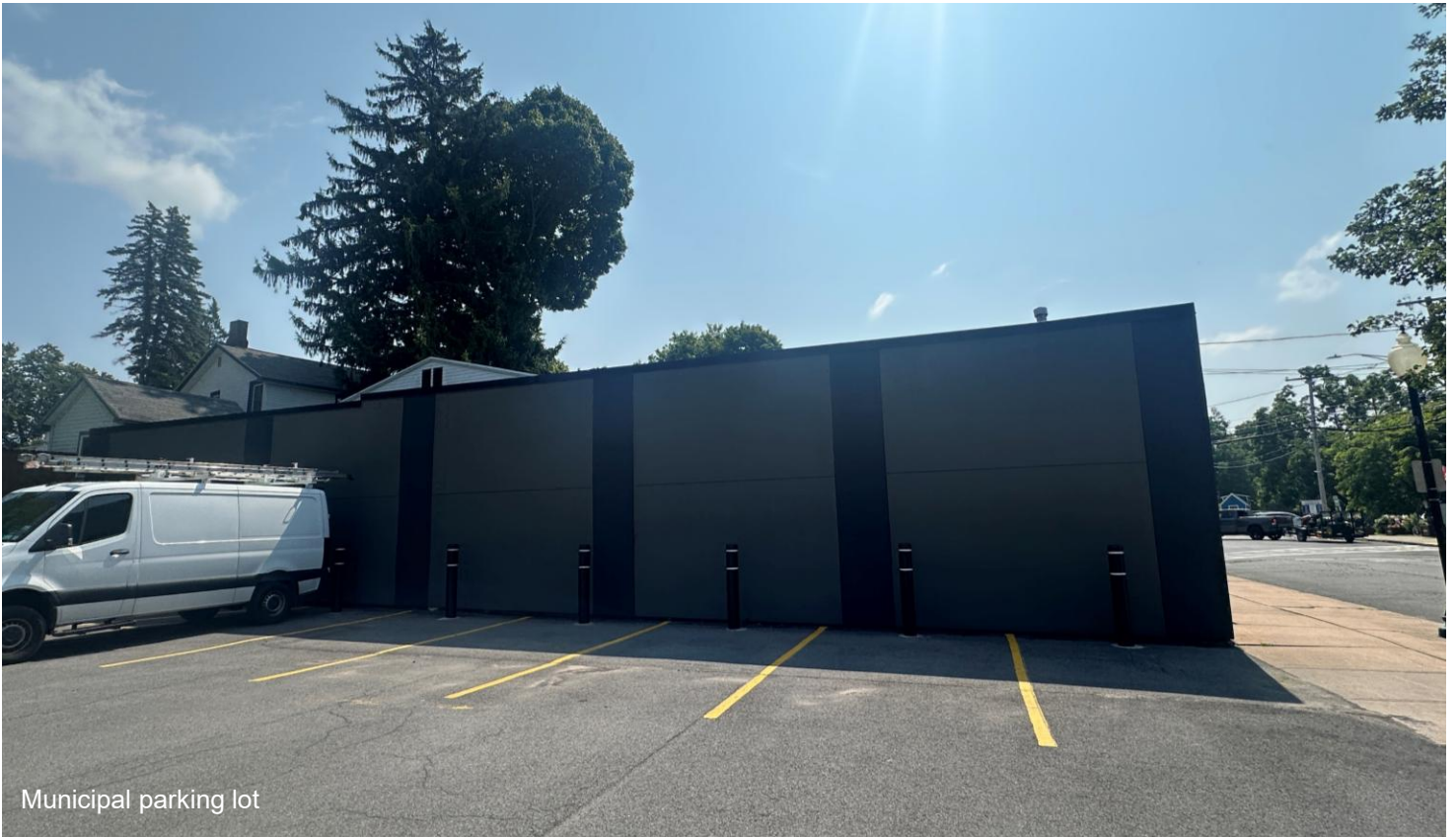
Municipal parking lot