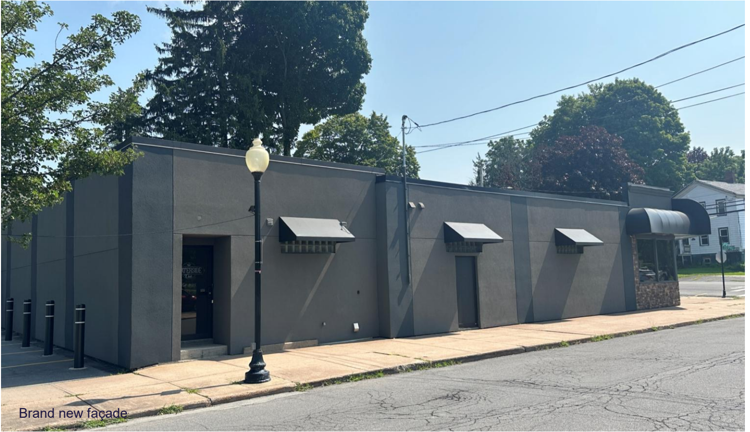
Brand new façade