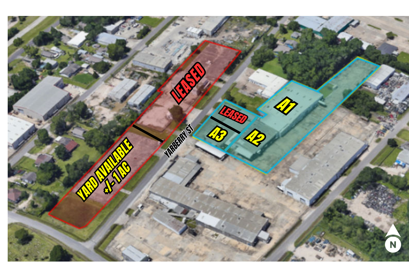
***Portions of property within 100-year or 500-year floodplain***

6575 West Loop S. Ste 680 Bellaire, TX 77401 713 461 4750 centermarkere.com