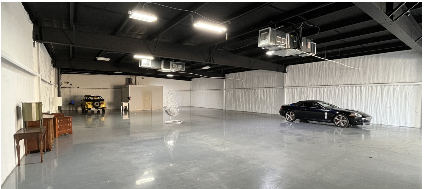
Interior of Warehouse