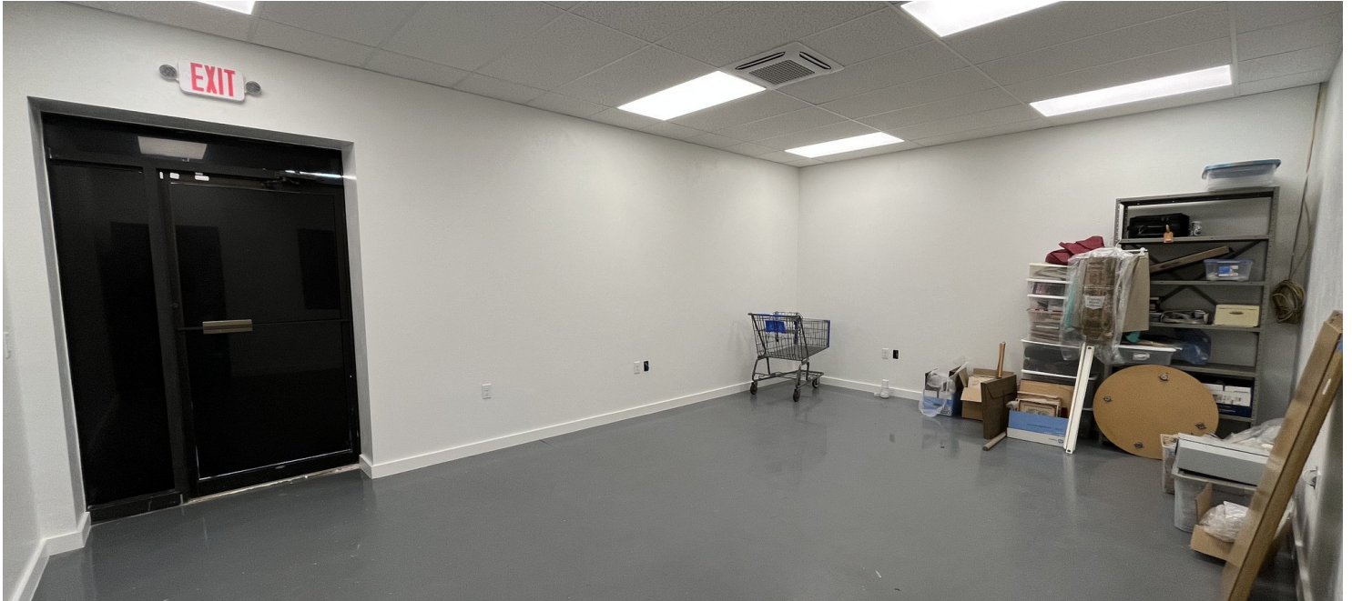
Office Space Photo