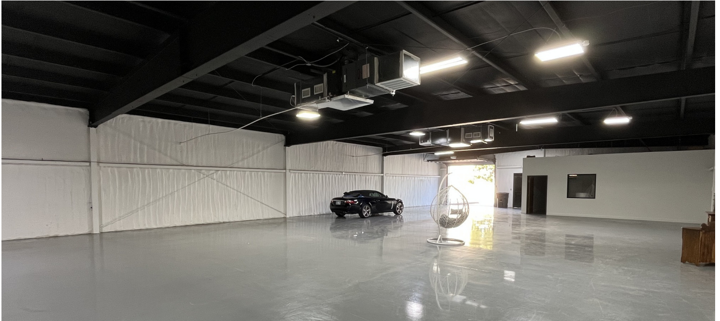
Interior of Warehouse