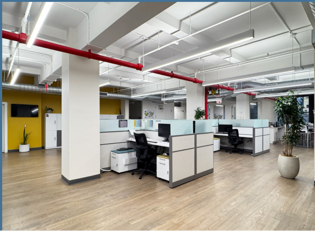
Entire 3rd Floor - Existing Conditions