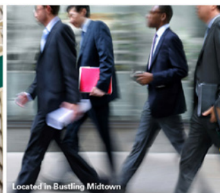
Located in Bustling Midtown