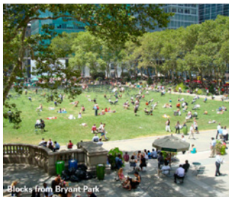
Blocks from Bryant Park