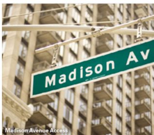
Madison Avenue Access