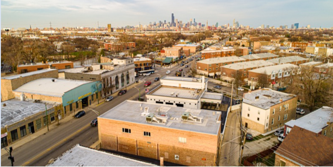
View downtown from the building