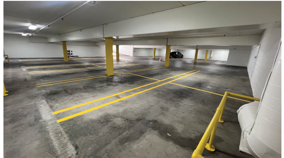
26 Subterranean, Secure Parking Stalls