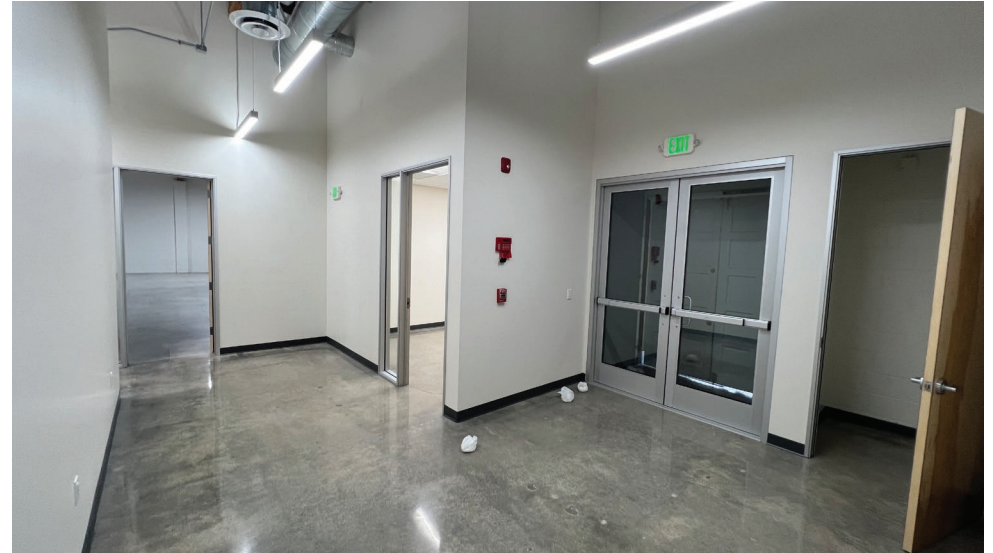
New Office Build-Out