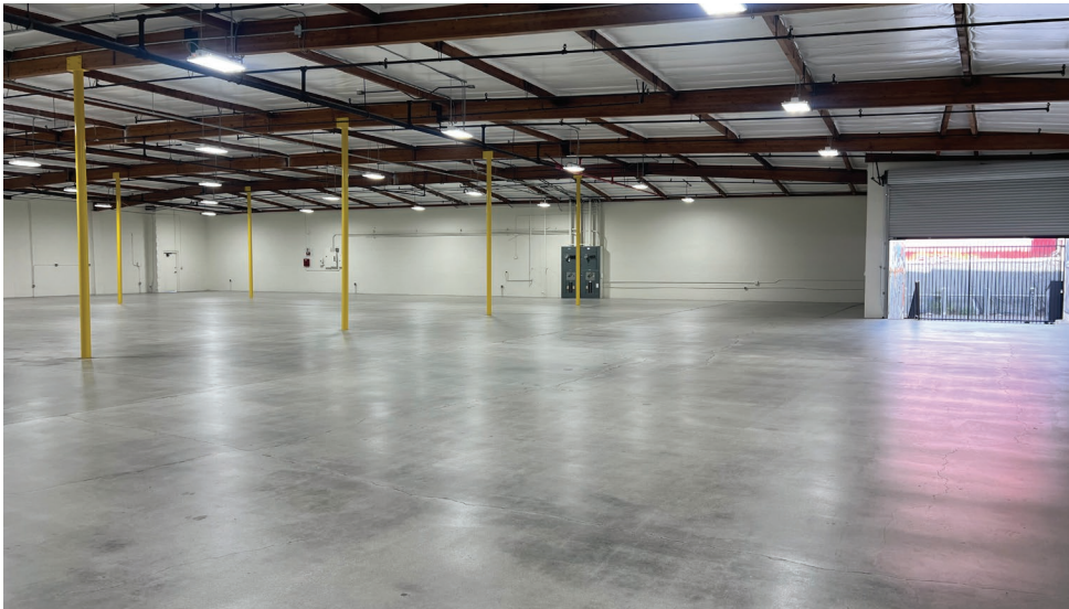
Warehouse and Dock High Loading