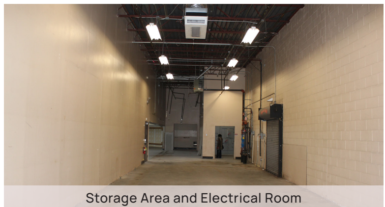
Storage Area and Electrical Room

4135 Ironbound Road, Williamsburg, VA 23188 | janetmooreccim.com | 757.645.4500