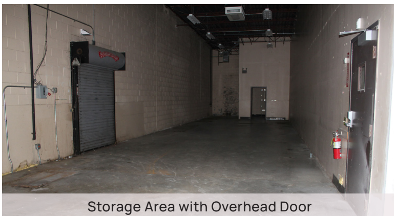
Storage Area with Overhead Door