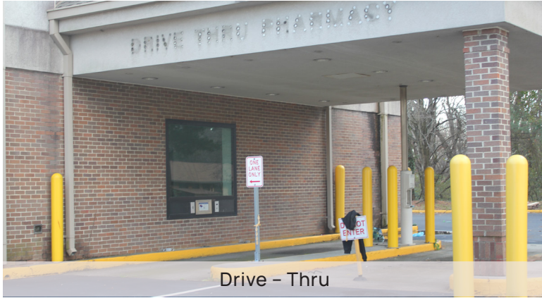
Drive - Thru