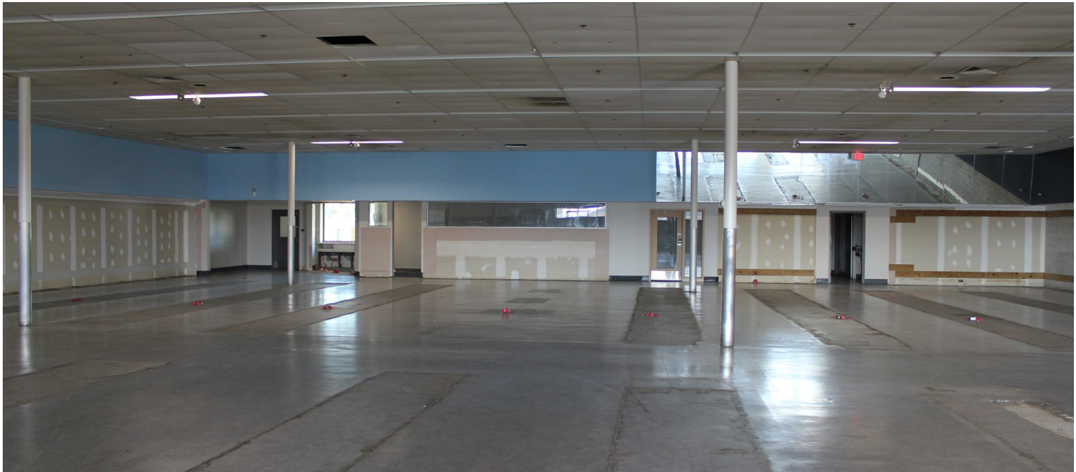
Expansive Retail Sales Area