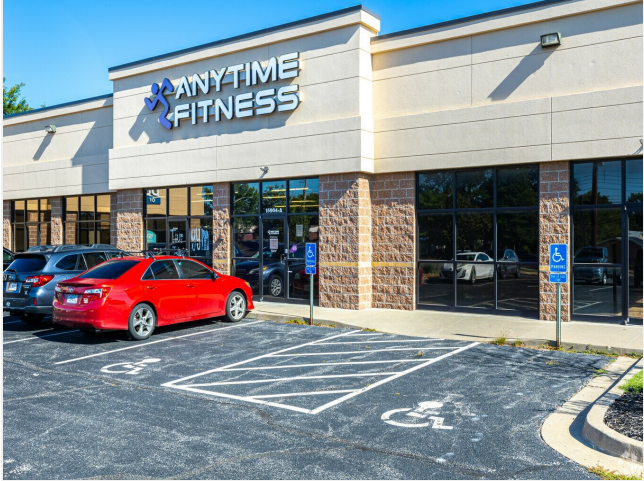
Close-up View of Front Door