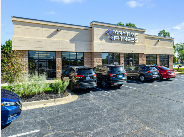
Alternate Angle of Building