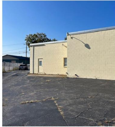
Side parking area