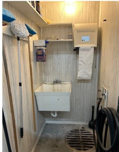
Slop sink area