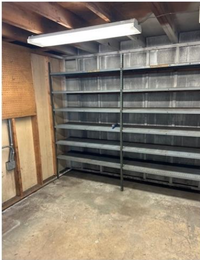
Warehouse storage area