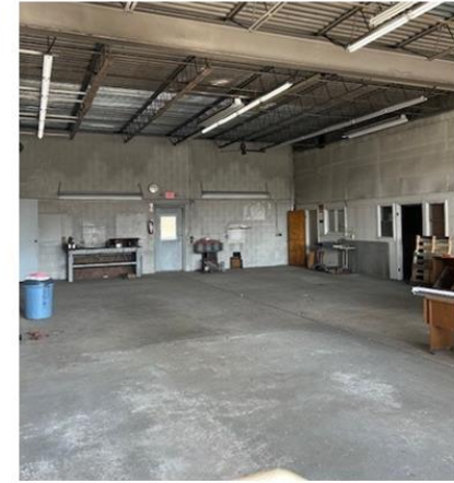
Open warehouse with 13' ceiling