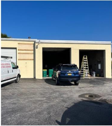
Easy access with 12x12 overhead doors