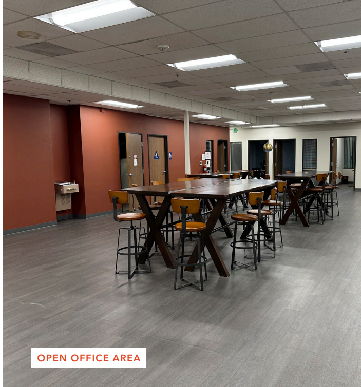
OPEN OFFICE AREA