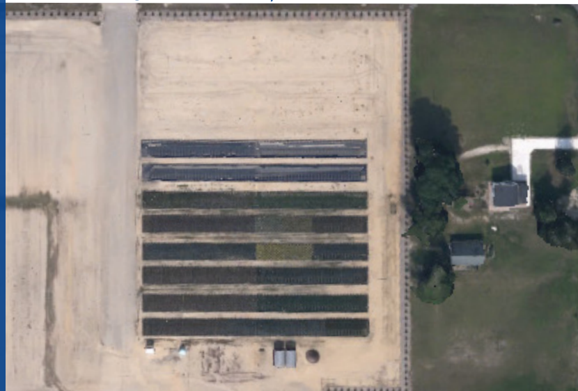
Union Road - 2,987 ADT