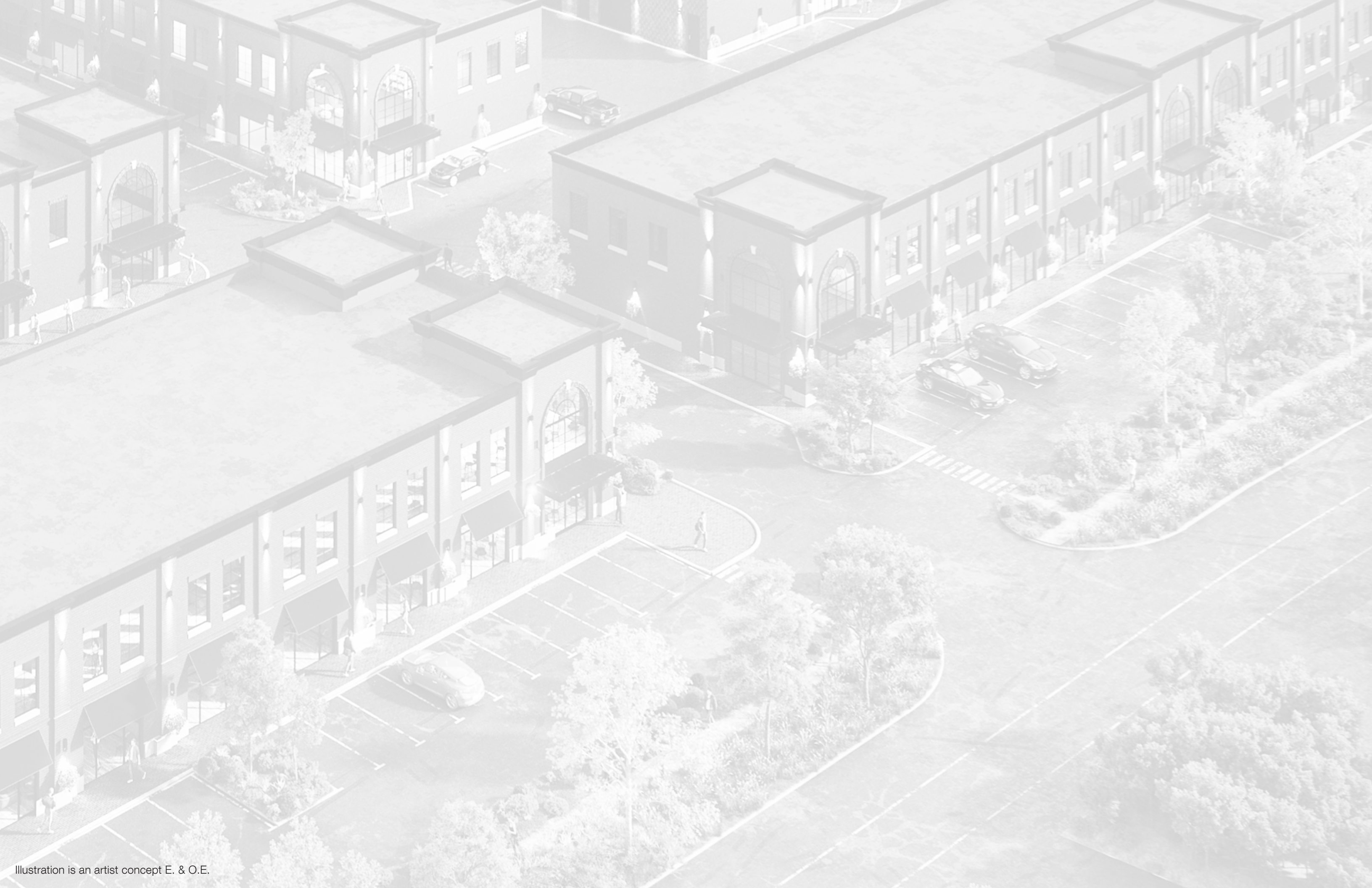
Illustration is an artist concept E. & O.E.