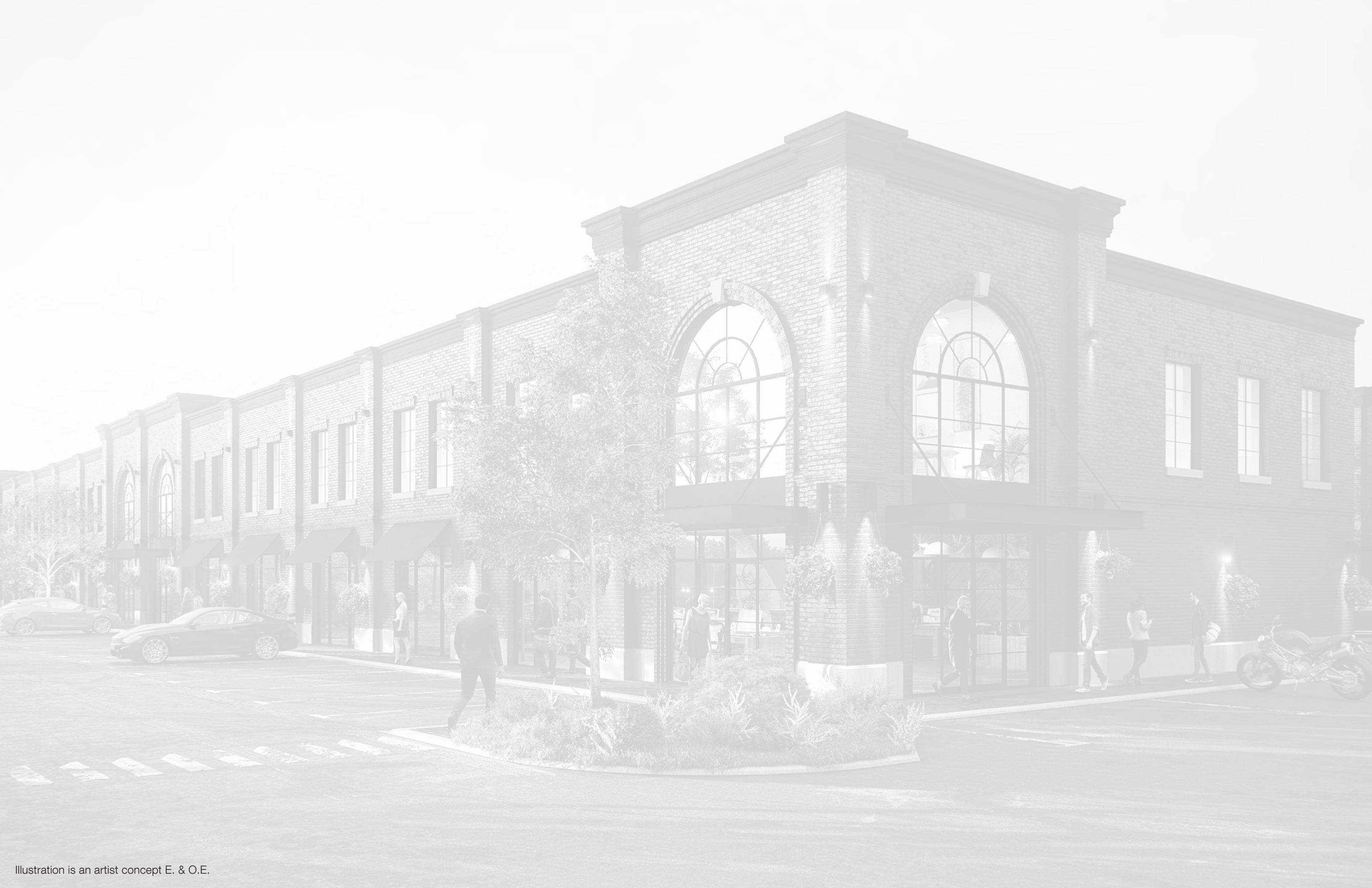
Illustration is an artist concept E. & O.E.