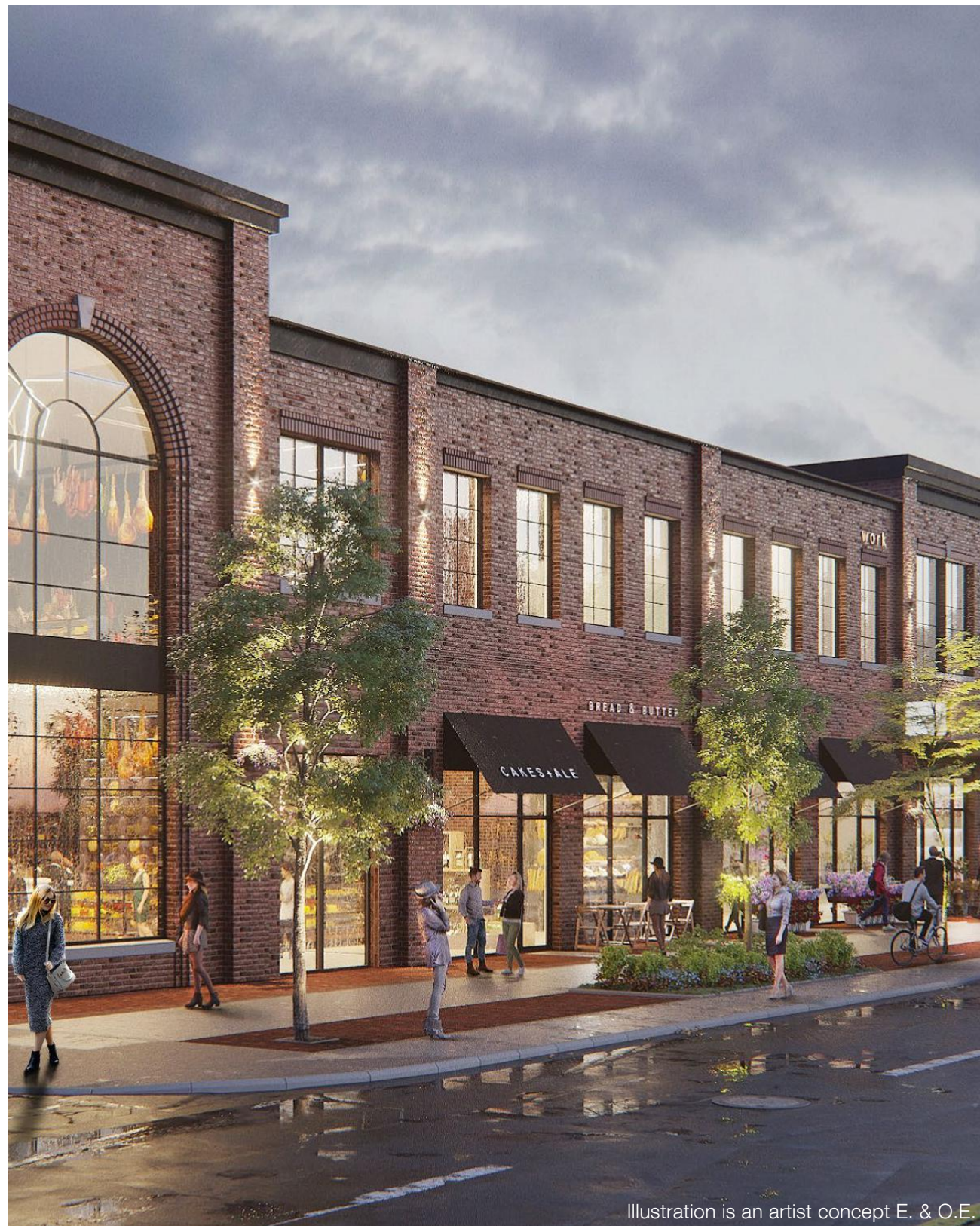
Illustration is an artist concept E. & O.E.