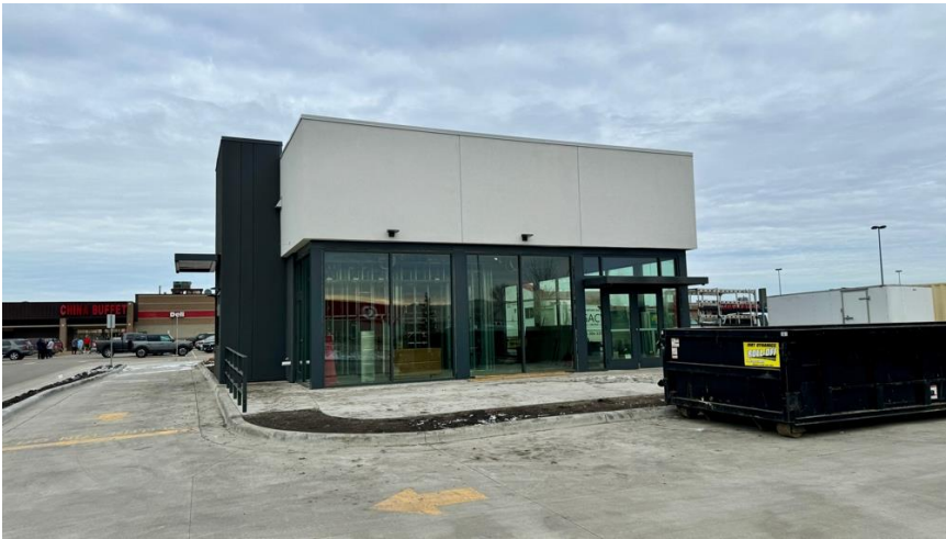
Starbucks – New 2023