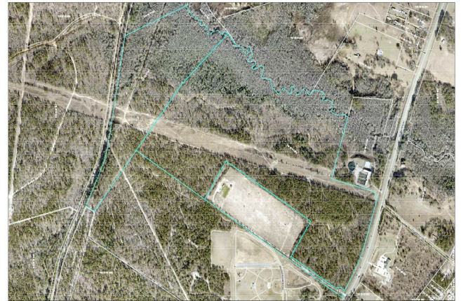
Prepared for: Aiken County Government 2/26/2024 4:07 Scale: 1 inch = 250 feet Parcel Map