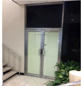
Lobby entrance for 2,200 SF retail space