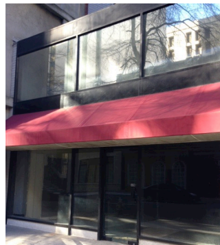
Main Street entrance for 2,200 SF retail space