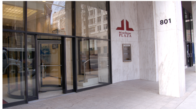
Wytestone Plaza Main Street entrance