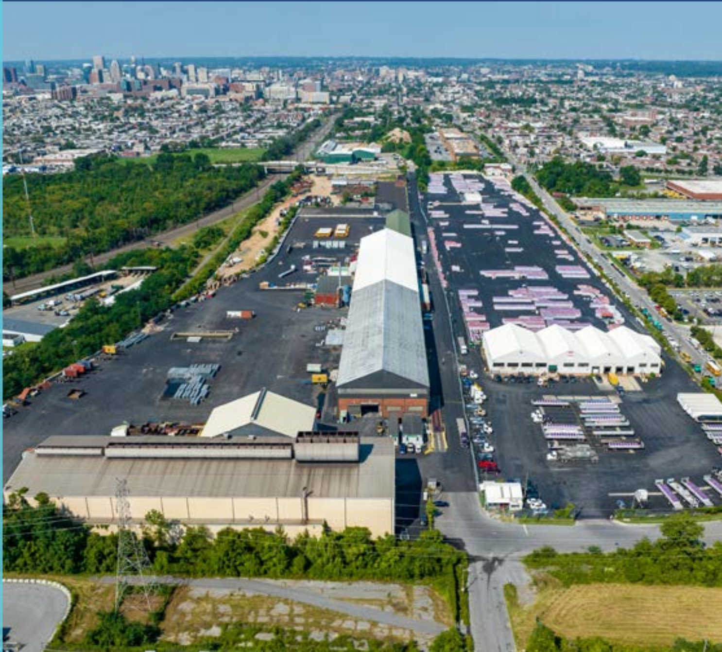
3501 E BIDDLE STREET BALTIMORE, MD 21213

212,000 SF WAREHOUSE/BUILDINGS ON 30 PAVED ACRES