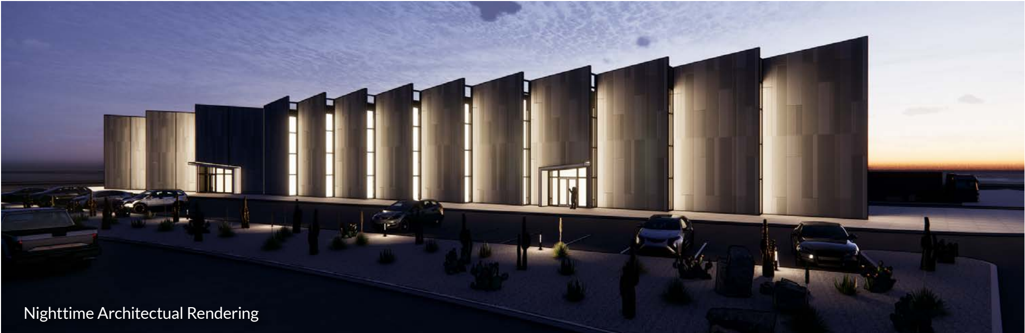
Nighttime Architectural Rendering