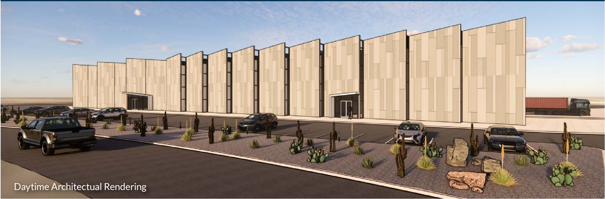
Daytime Architectural Rendering