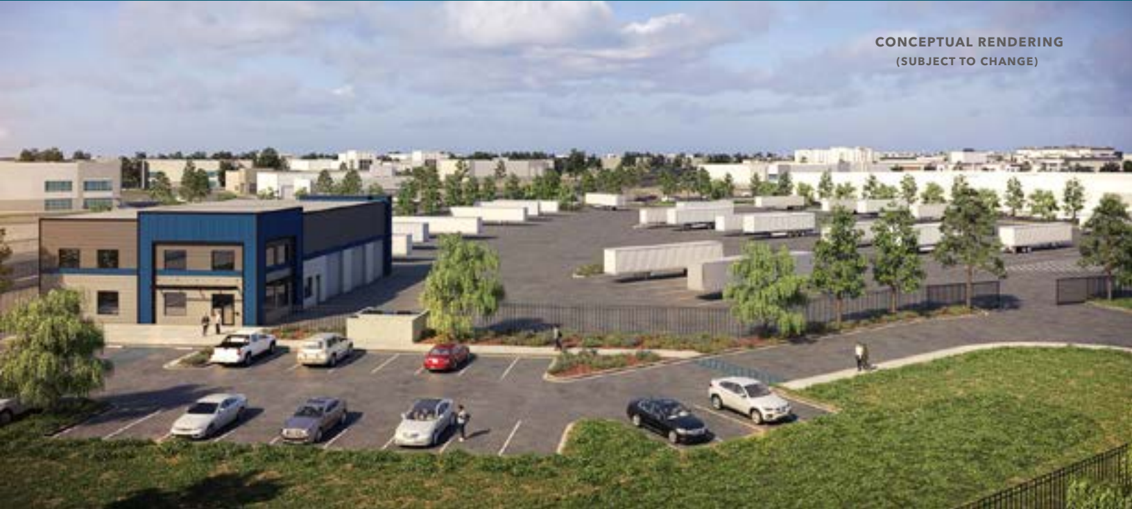
CONCEPTUAL RENDERING (SUBJECT TO CHANGE)

680 S ALLEN STREET, SAN BERNARDINO, CA 92408