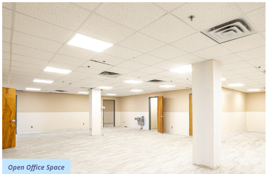
Open Office Space