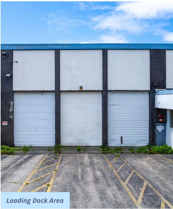
Loading Dock Area