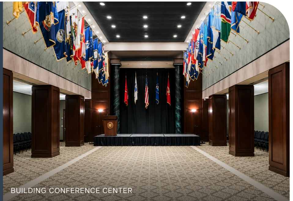
BUILDING CONFERENCE CENTER