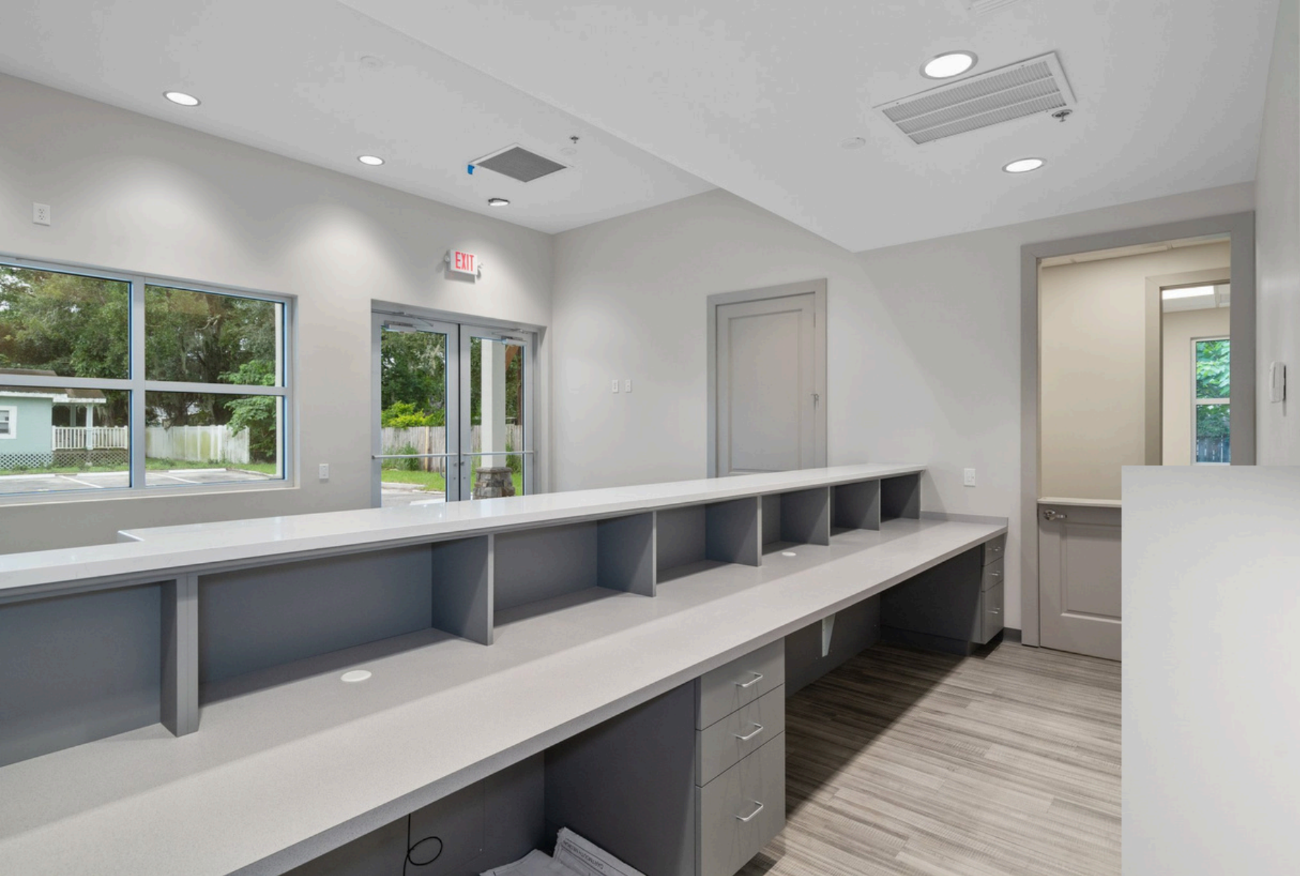
Lobby/Reception 18'9" x 20'5" A sleek reception desk runs along the length of the hall, where staff greet guests with professionalism.

Examining room (6) 1) 10'9" x 9'11" 2) 10'9" x 9'11" 3) 10'9" x 10'4" 4) 9'2" x 9'2" 5) 11'2" x 9'2" 6) 10'0" x 9'2" The facility includes 6 examination rooms, with 2 convertible for dental use. Each room is thoughtfully designed to provide a calm and professional atmosphere, ensuring a comfortable experience for patients