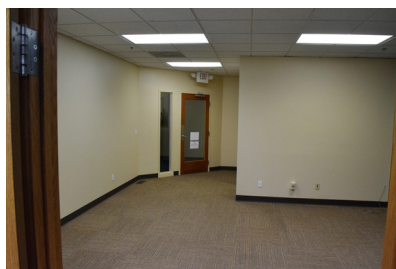
Office #1, looking to entrance