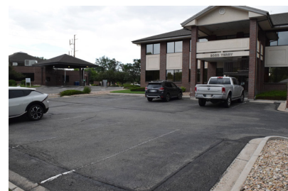
1 of 2 parking lots