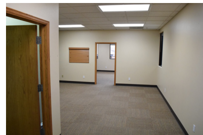
Office #1, break room to left