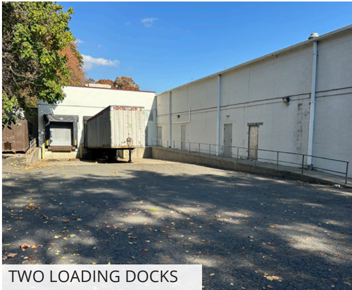
TWO LOADING DOCKS