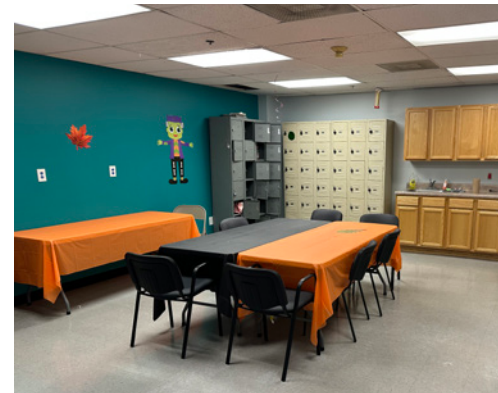
LOWER LEVEL | BREAK ROOM