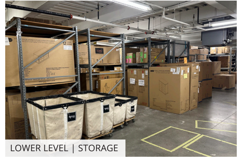
LOWER LEVEL | STORAGE