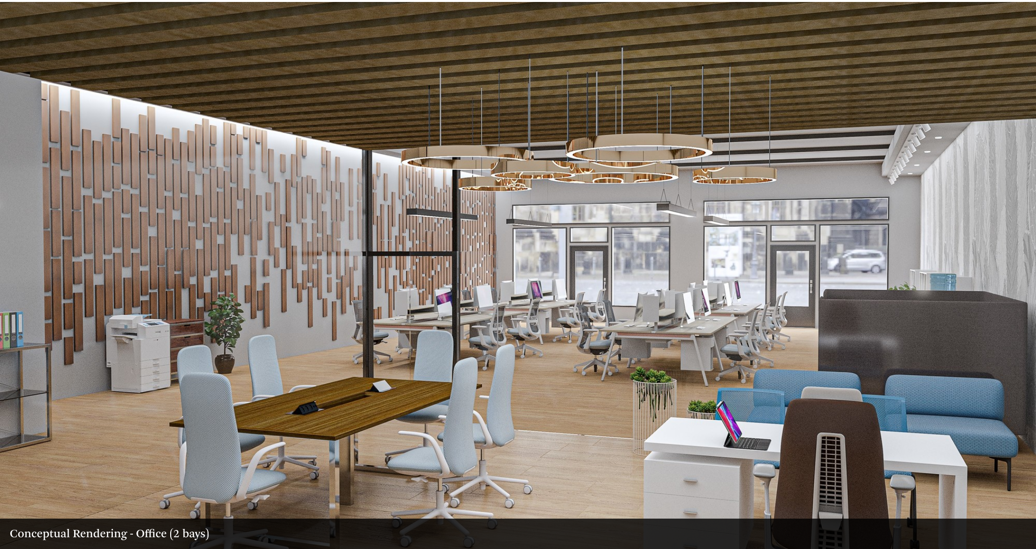
Conceptual Rendering - Office (2 bays)