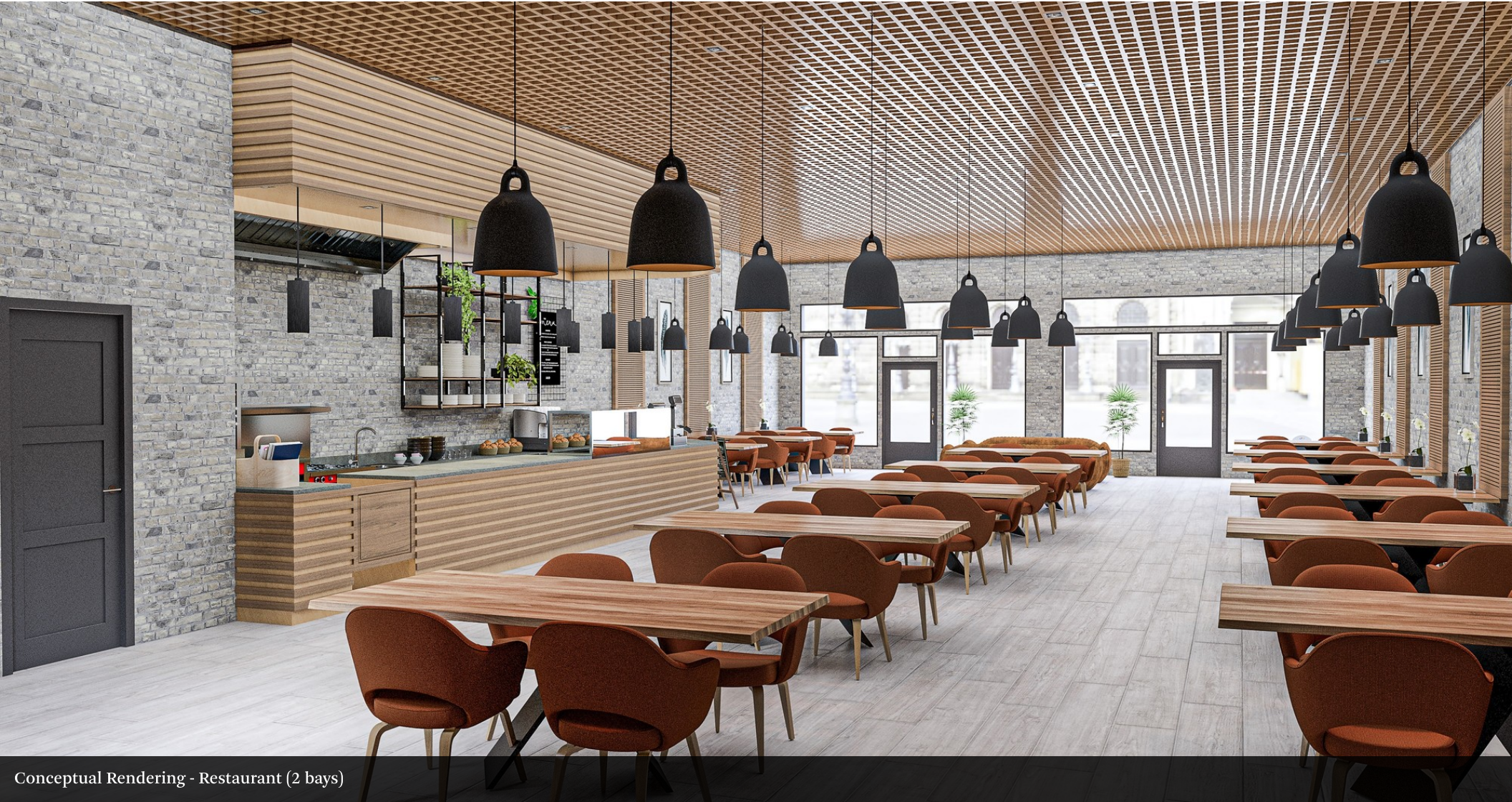
Conceptual Rendering - Restaurant (2 bays)

Jeff Goldman 919-909-5400 m jeffgoldman@gmail.com