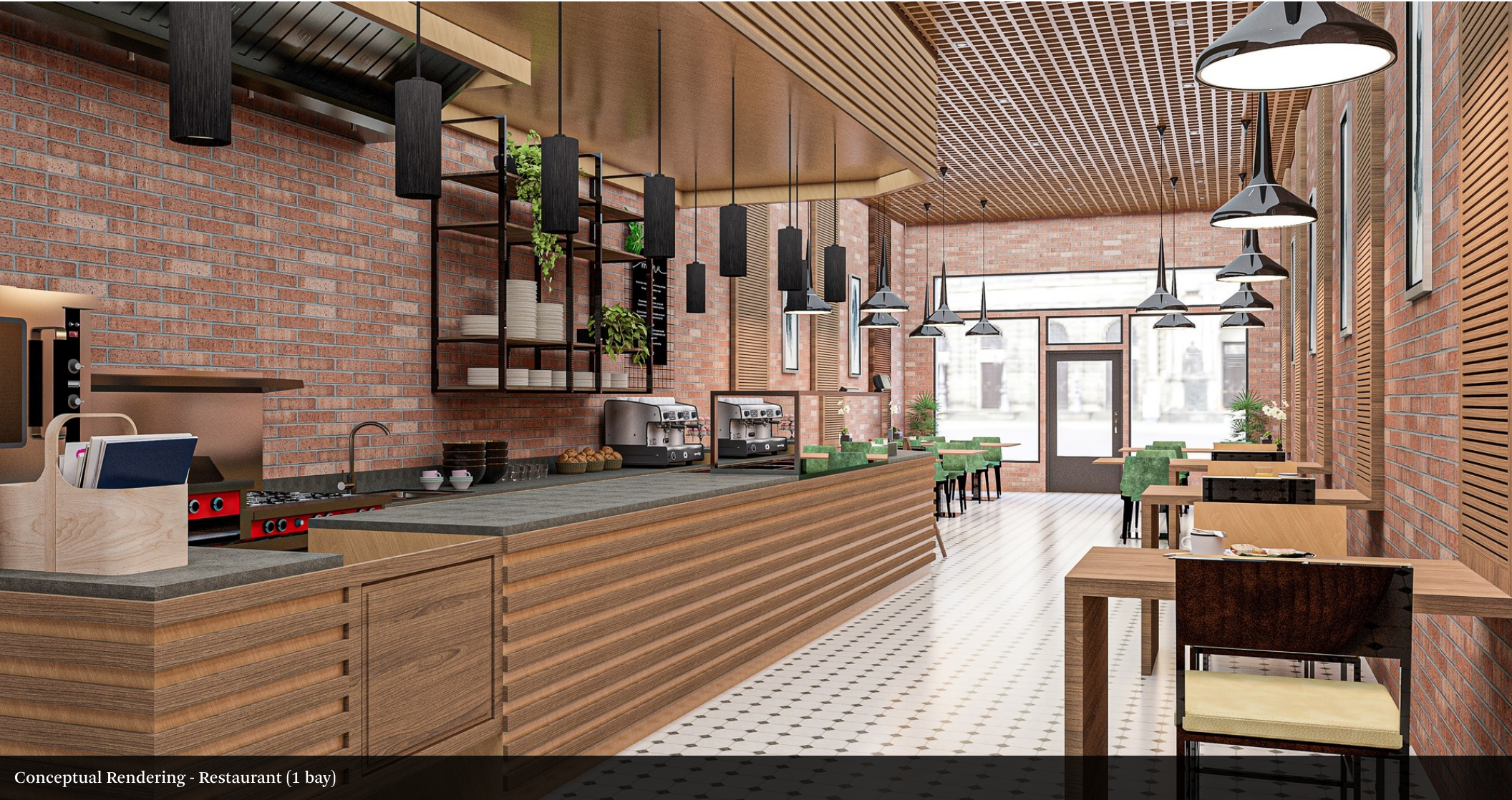
Conceptual Rendering - Restaurant (1 bay)

Jeff Goldman 919-909-5400 m jeffgoldman@gmail.com