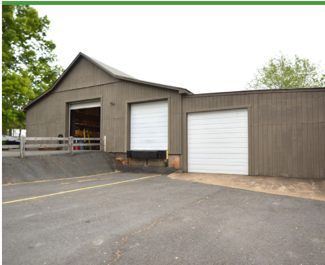
Three drive-in bays on side of warehouse