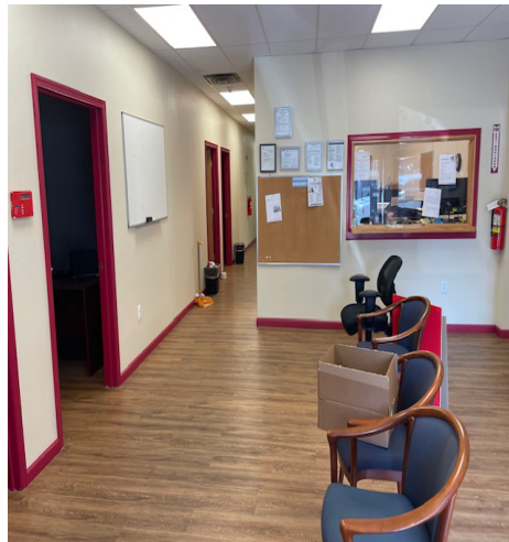
Germantown Avenue Lobby