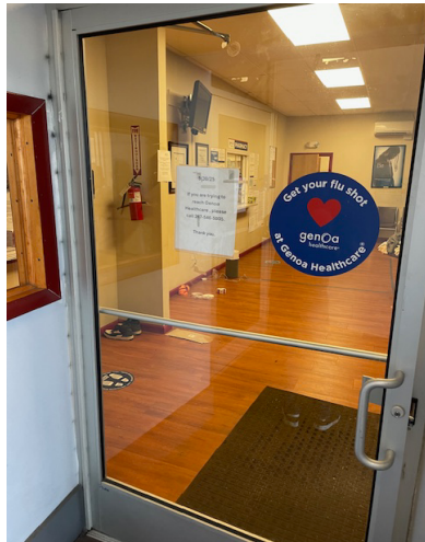
Broad Street Lobby