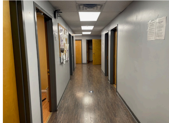
Broad Street 2 nd Floor - 5,900 +/- Sq. Ft.