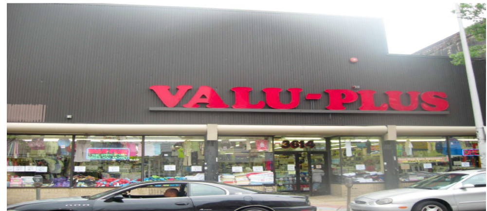
3614 Germantown Avenue – Bldg #3 (2 Germantown Avenue Entrances)