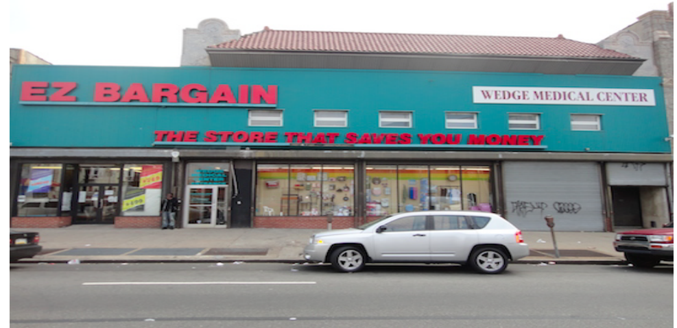
3609-13 N. Broad Street – Bldg #2 (2 Broad Street Entrances)