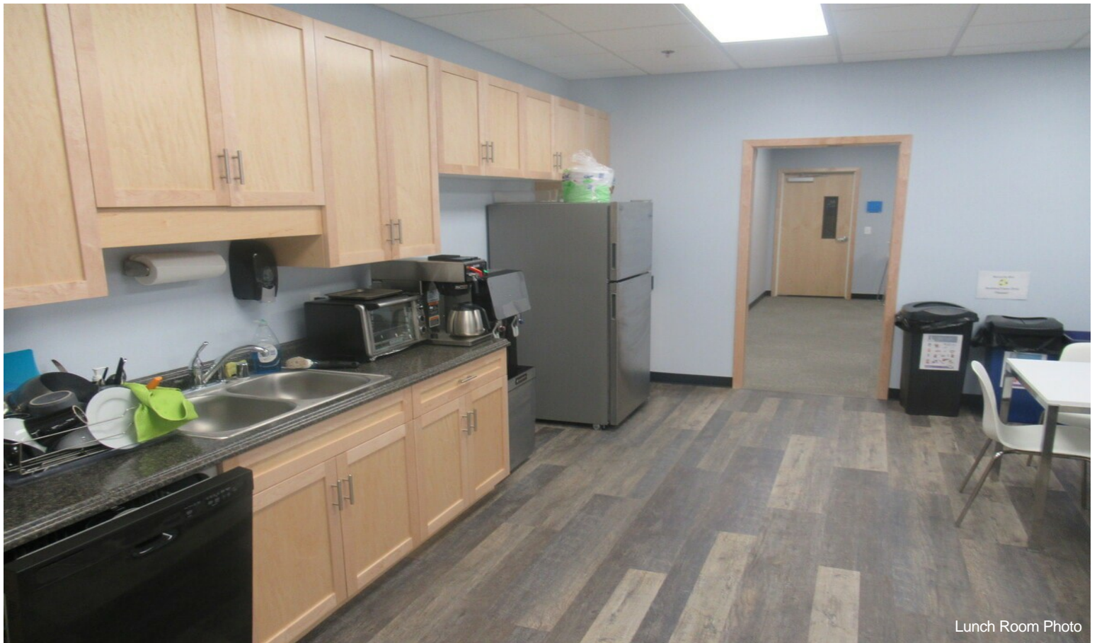
Lunch Room Photo