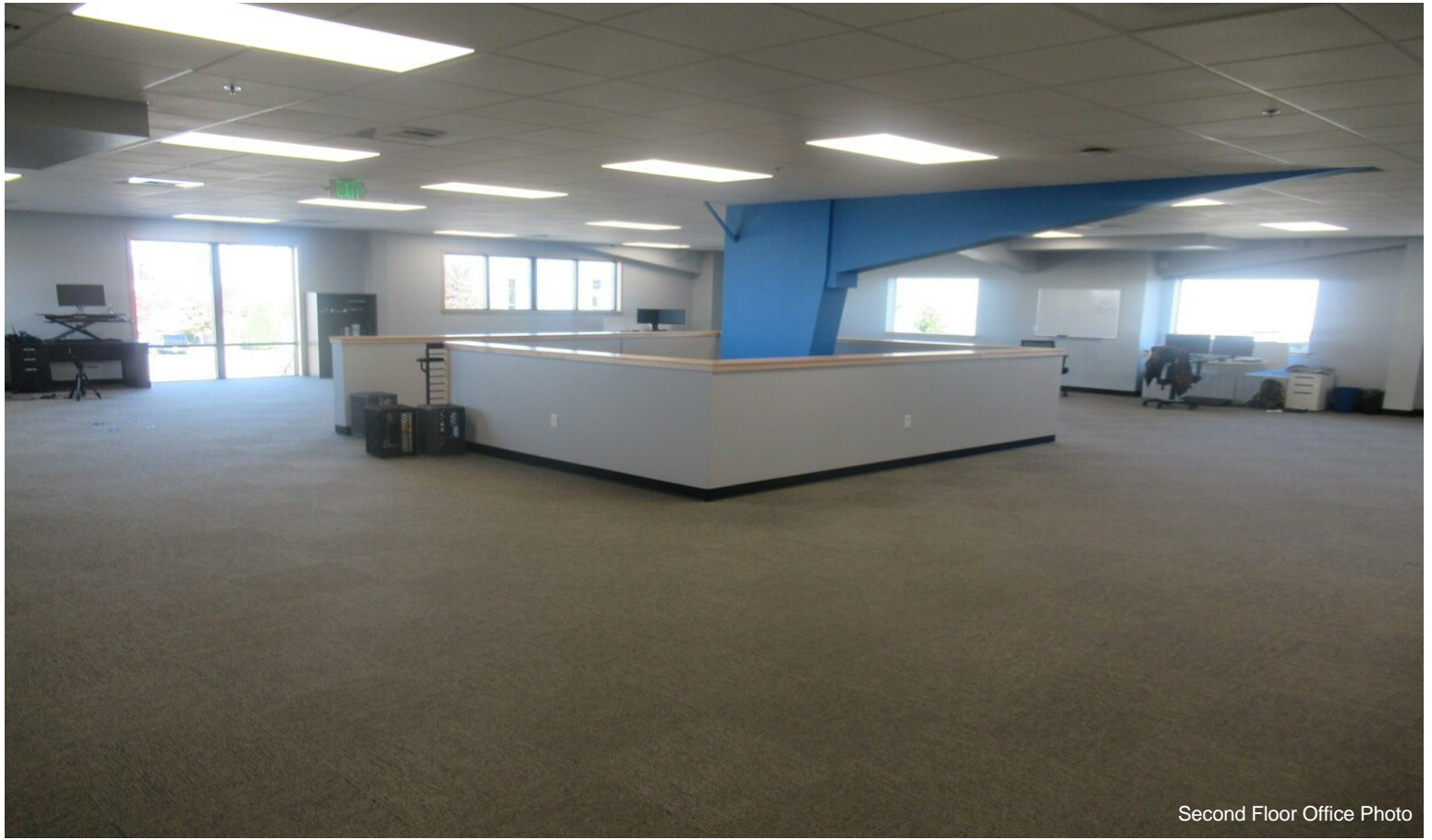
Second Floor Office Photo