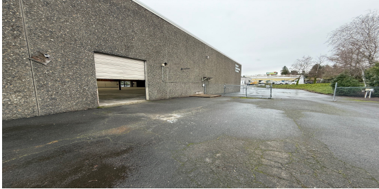
Fenced Yard Area