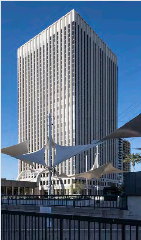
3838 TOWER 3838 North Central Ave.