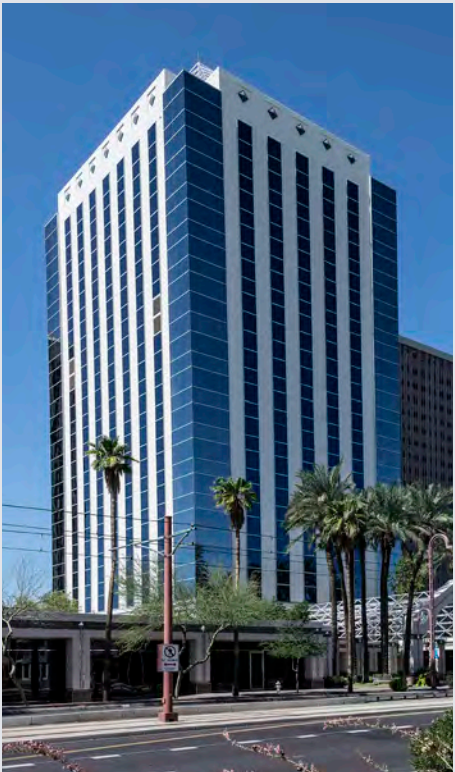
3800 TOWER 3800 North Central Ave.