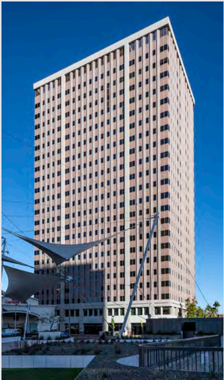
4000 TOWER 4000 North Central Ave.