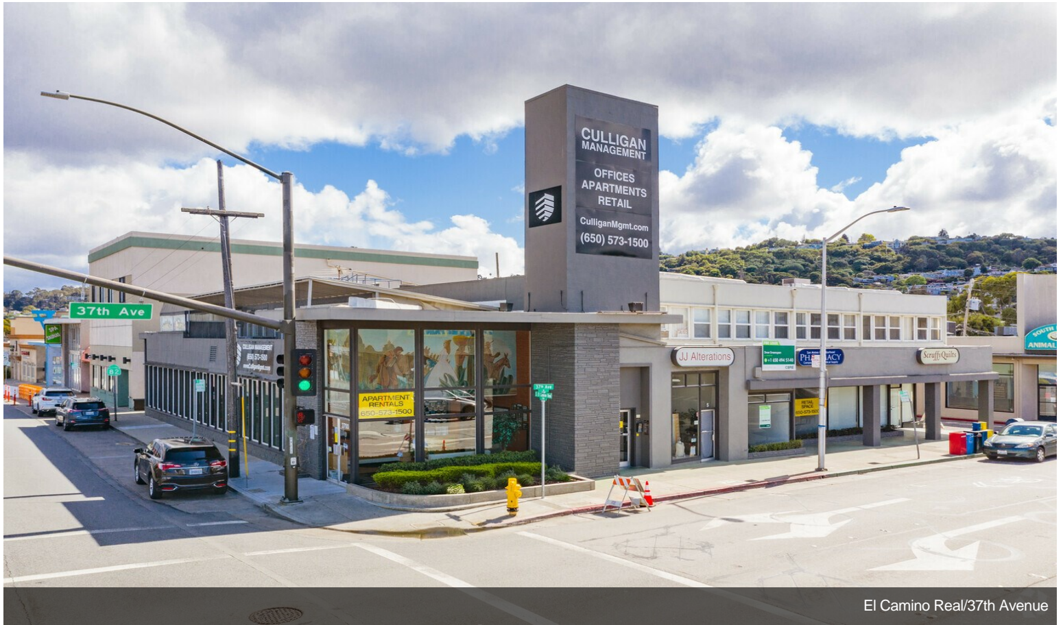
El Camino Real/37th Avenue