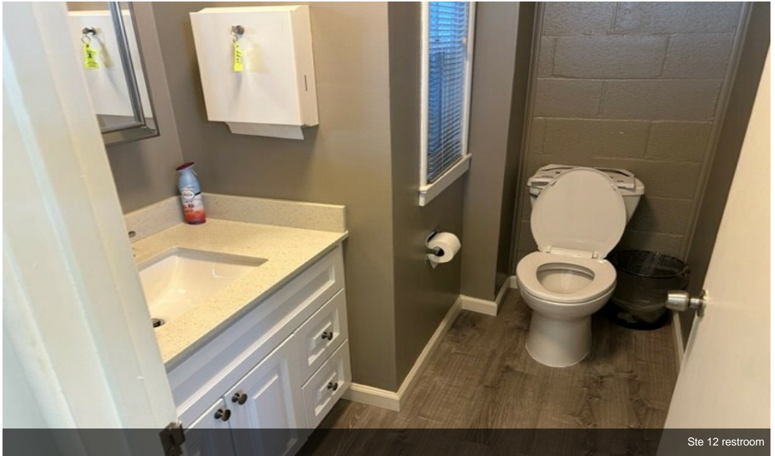
Ste 12 restroom