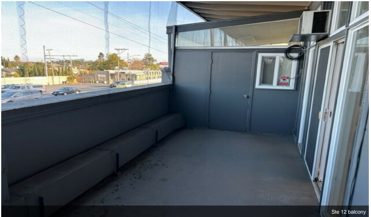
Ste 12 balcony