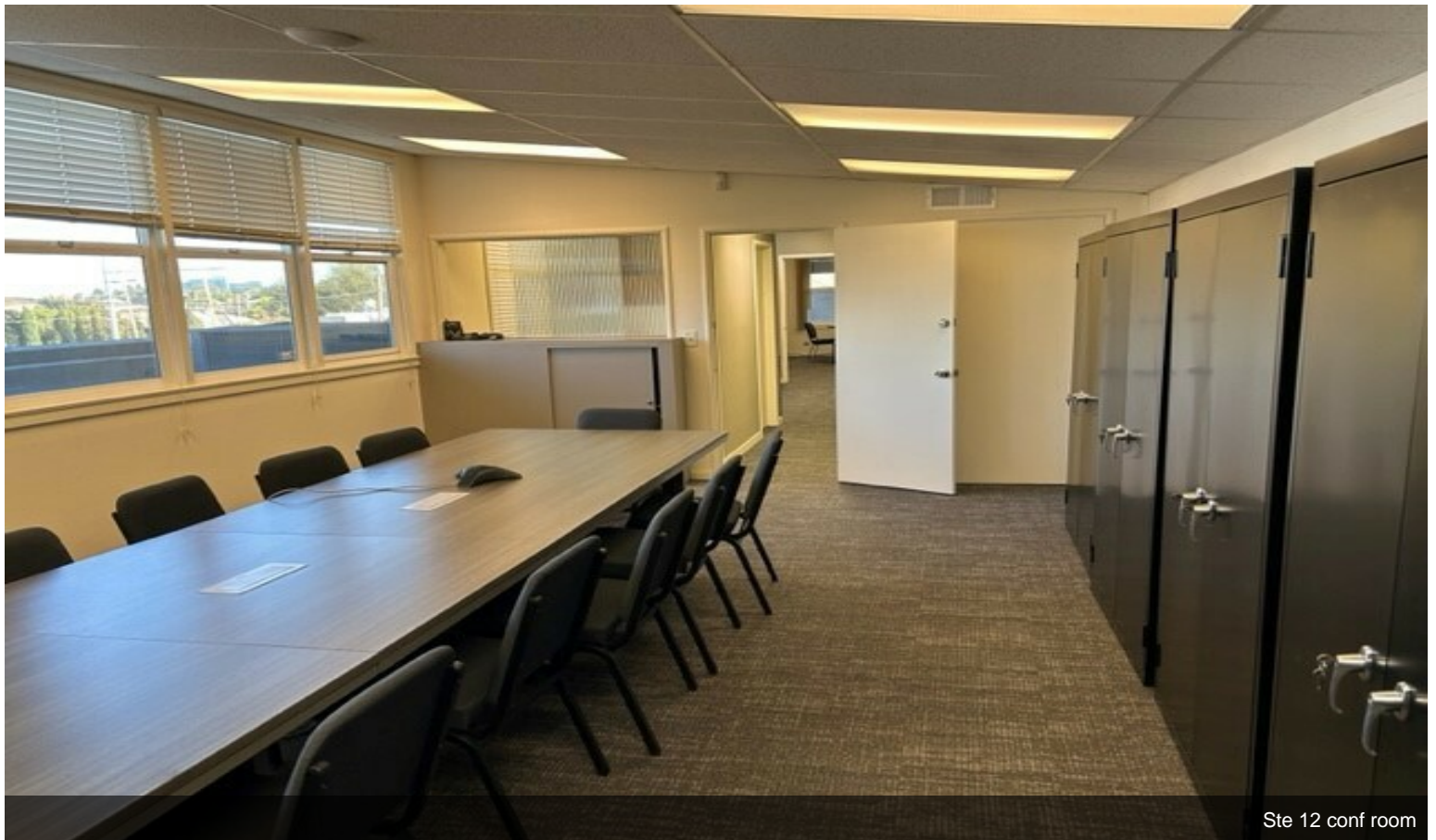
Ste 12 conf room