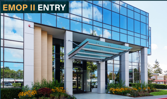
EMOP II ENTRY