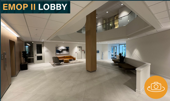
EMOP II LOBBY