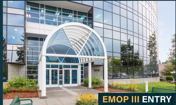
EMOP III ENTRY