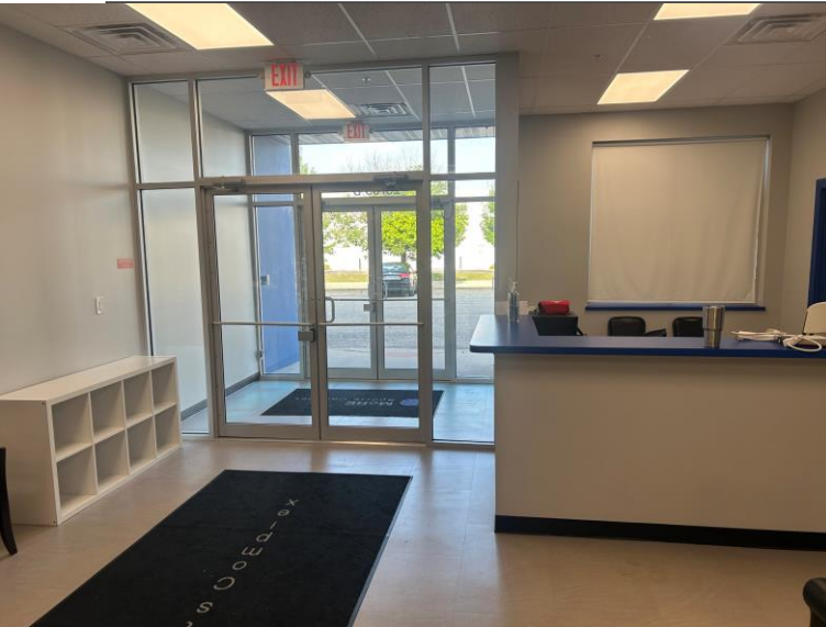
Lobby & waiting Area