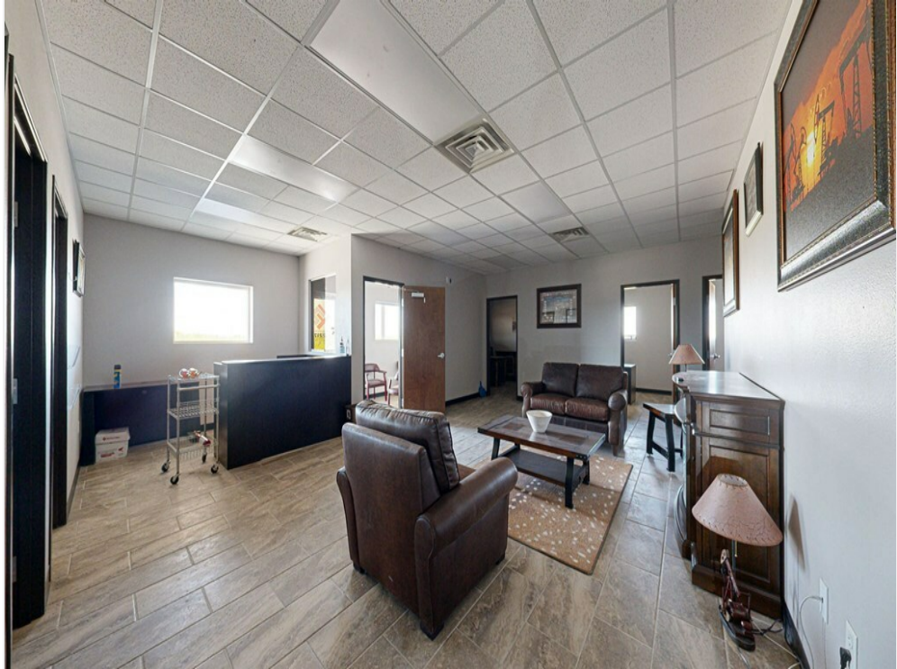
Reception and Waiting area