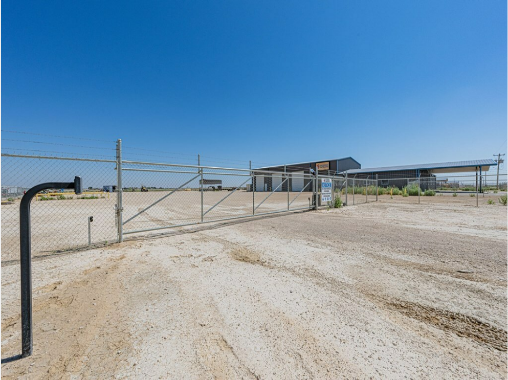
Fence and Gate