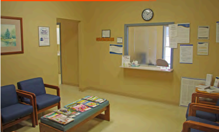
700 SF SPACE