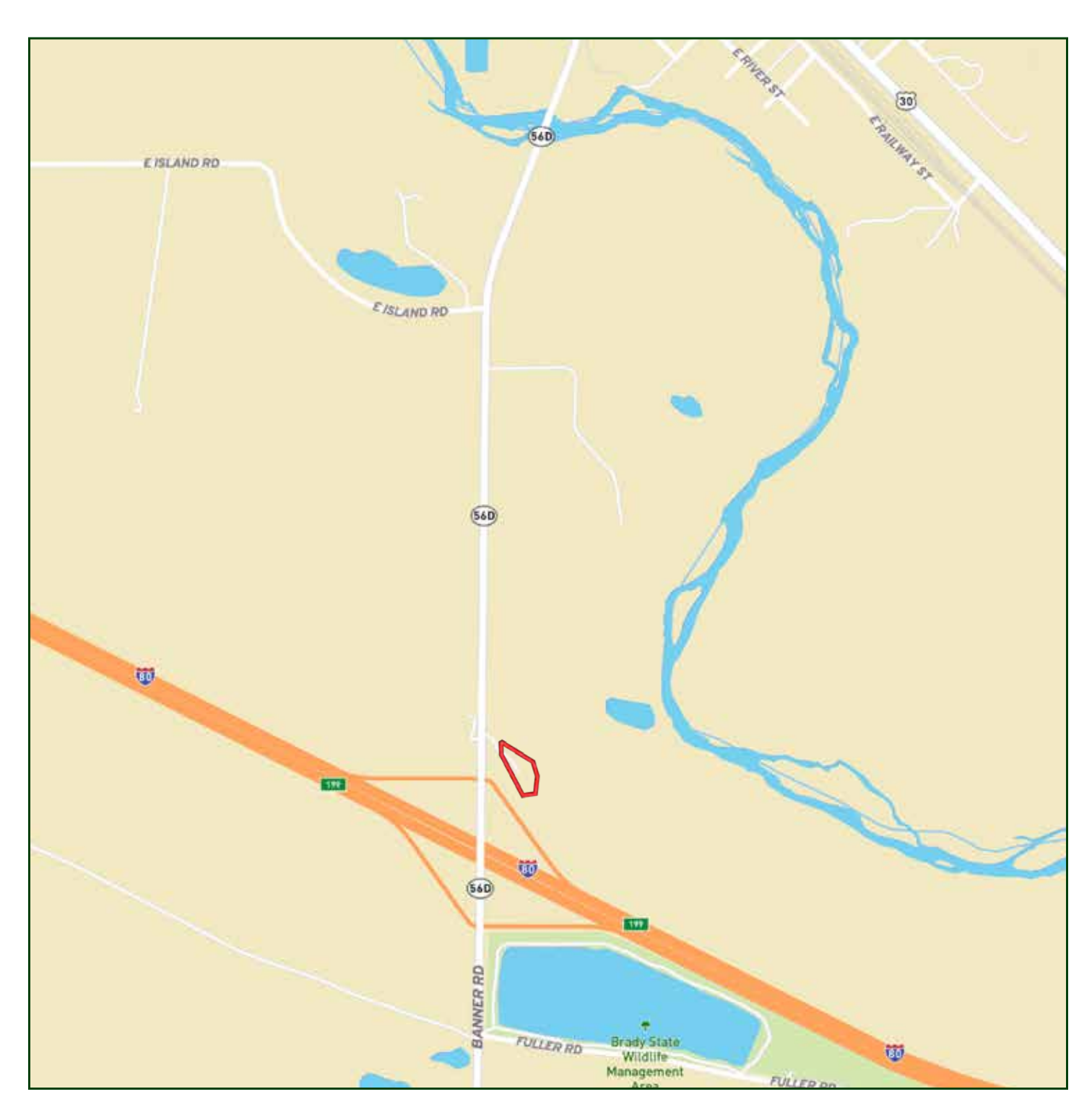
Boundary lines are estimates - Map for illustration only