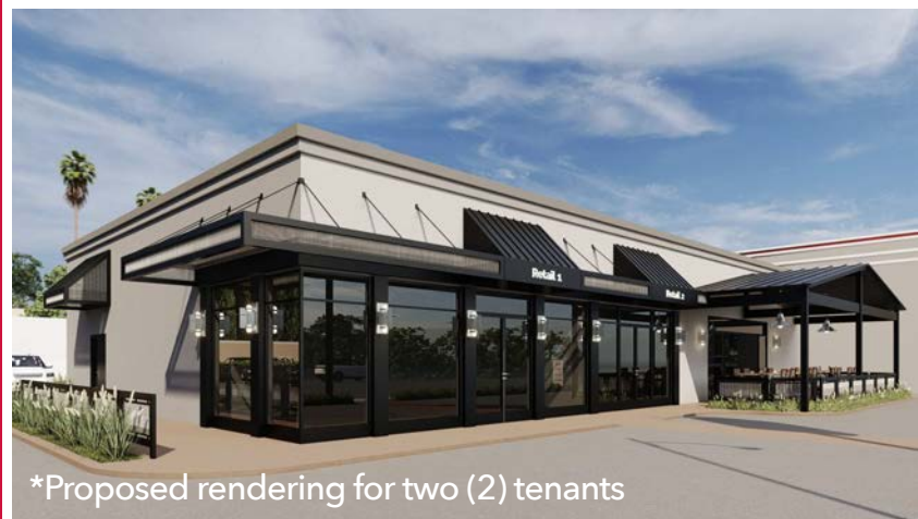
*Proposed rendering for two (2) tenants