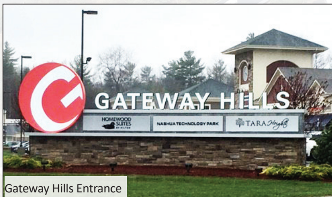
Gateway Hills Entrance