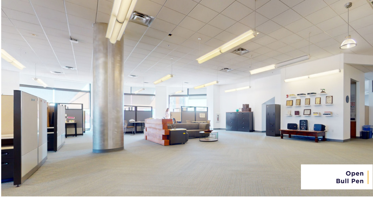
Open Bull Pen