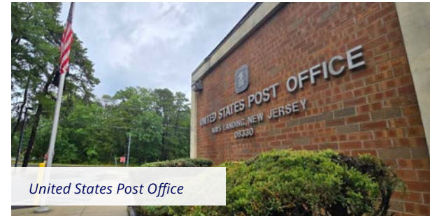
United States Post Office